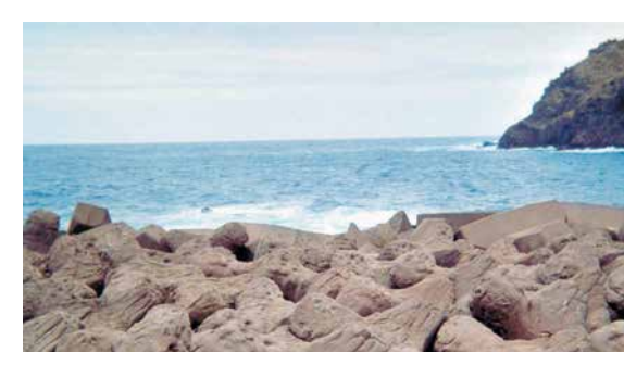
ECOPODE™ placed over a crest

NB: higher rates can be obtained using hydraulic placing equipment with small size units.